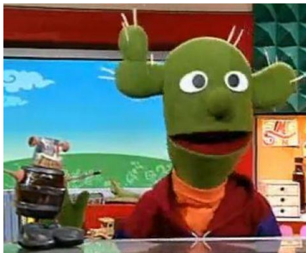
Figure 2. Kishkashta, the male cactus

For example, cacti are not people. They often have male and female parts in the same flower. The children’s television character Kishkashta, a cactus, is always presented as a male. He is neither man nor boy, but identifies as male – prior to the recent ruling that RDA translations need not be absolutely literal, how could the gender table be translated in a manner which allowed for a male-only specimen of a bi-gendered plant species?